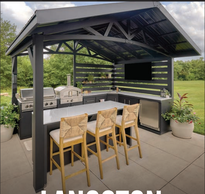
LANGSTON Built-In Appliance Unit